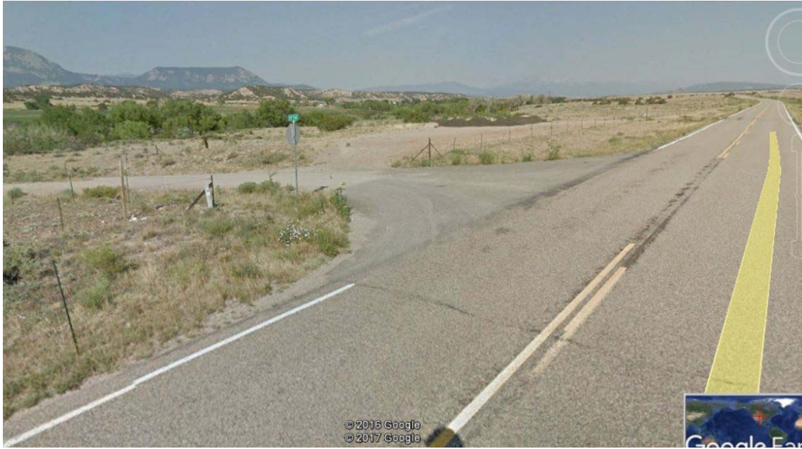
Turn left off Hwy 69 onto CR 540