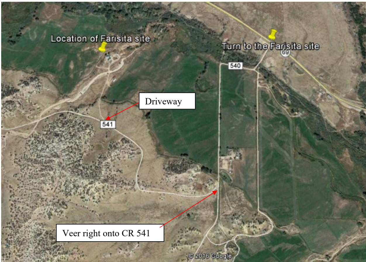
Go south on CR 540 then veer west onto CR 541 to the driveway.